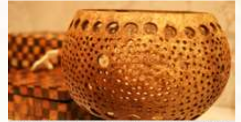
Crafts of Lakshadweep Islands

Design traditional ornaments (like necklaces, rings, bangles, bracelets and anklets made in beautiful design and patterns) using polymer clay, shells, decorative material.